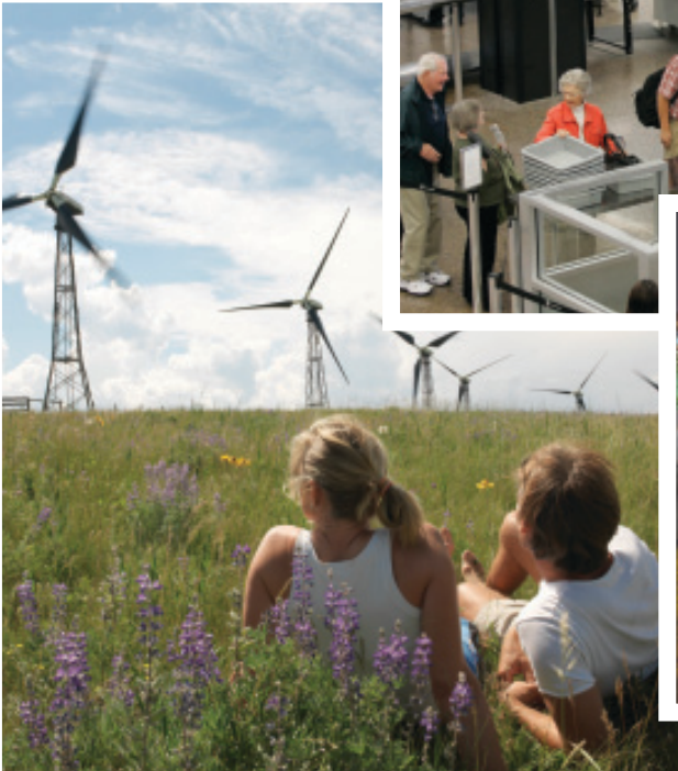
Political and economic decisions affect the development of energy resources, such as wind energy. Think critically: How do they connect to decisions about the environment and quality of life?