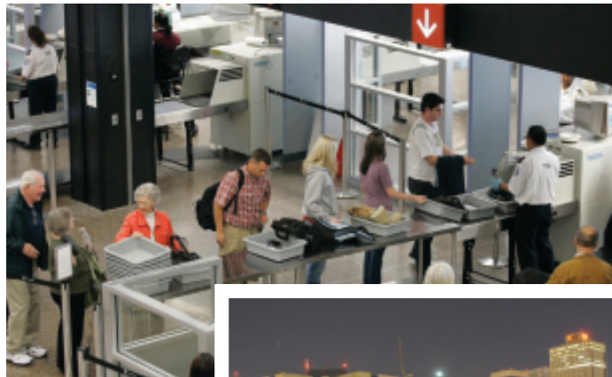
Passengers at an airport line up for security screening. Think critically: How do Canadians’ individual rights affect security searches and policing?