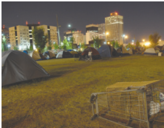
In 2007, some of the people who lived in this tent city in Edmonton had no other place to go. Think critically: What options do people in Canadian society have if they can’t meet their basic needs?