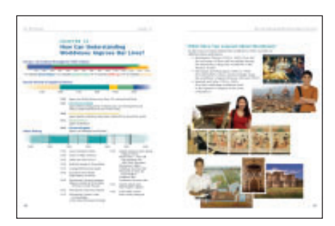
Chapter 10: How Can Understanding Worldviews Improve Our Lives?