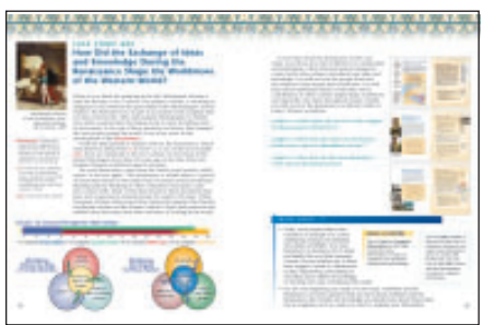
Case Study One: How Did the Exchange of Ideas and Knowledge During the Renaissance Shape the Worldview of the Western World?

There are three case studies presented in the text. Each will illustrate different things about worldview. Chapter 10 will tie together the ideas you learned about in the case studies.