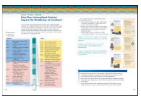
Case Study Three: How Does Intercultural Contact Impact the Worldviews of Societies?