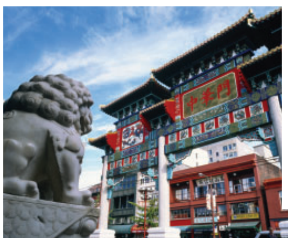
Chinese Cultural Centre, Vancouver, BC

You, as an individual Canadian citizen, are affected by a number of worldviews that affect how you view and relate to the world. Think about how the perspectives of all the groups you are a part of — family, friends, church, cultural group, and so on — relate to your overall values and beliefs about the world.