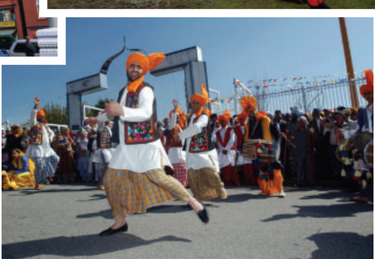
Sikh dancers at Vaisakhi celebration, Vancouver, BC

You, as an individual Canadian citizen, are affected by a number of worldviews that affect how you view and relate to the world. Think about how the perspectives of all the groups you are a part of — family, friends, church, cultural group, and so on — relate to your overall values and beliefs about the world.