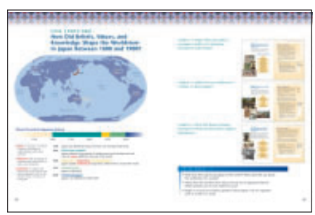
Case Study Two: How Did Beliefs, Values, and Knowledge Shape the Worldview of Japan Between 1600 and 1900?